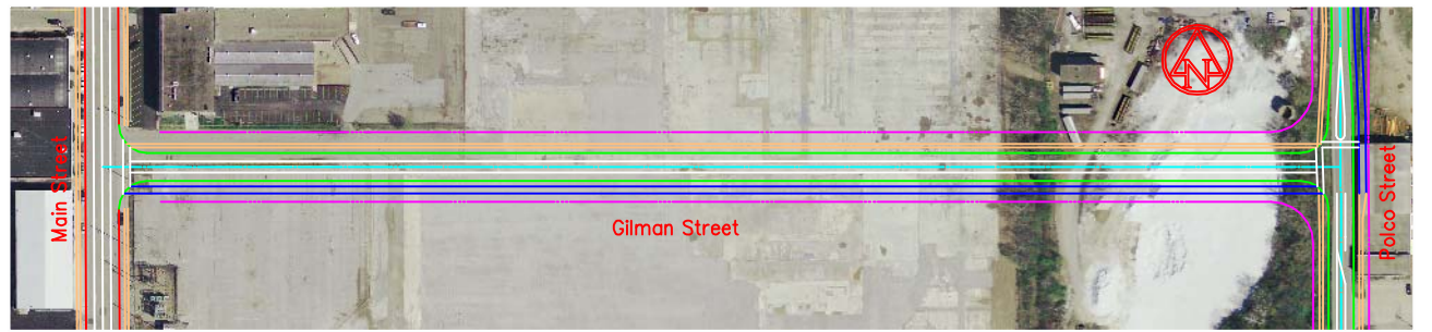
Gilman Street Scale: 1" = 300'