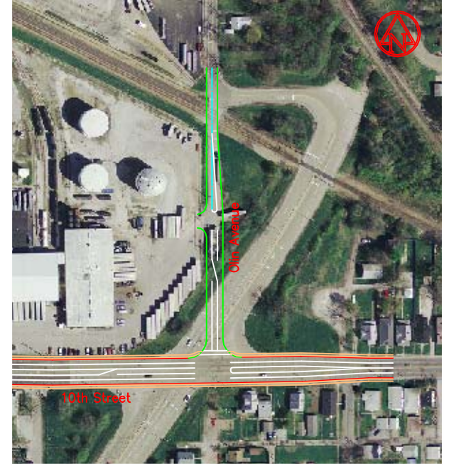
Olin Avenue at 10th Street