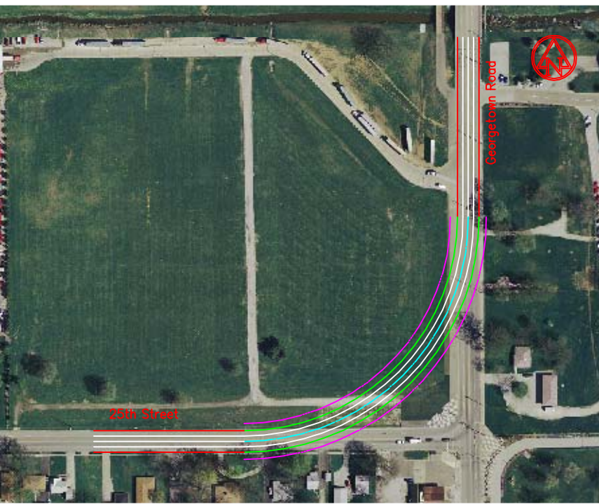
Georgetown Road at 25th Street