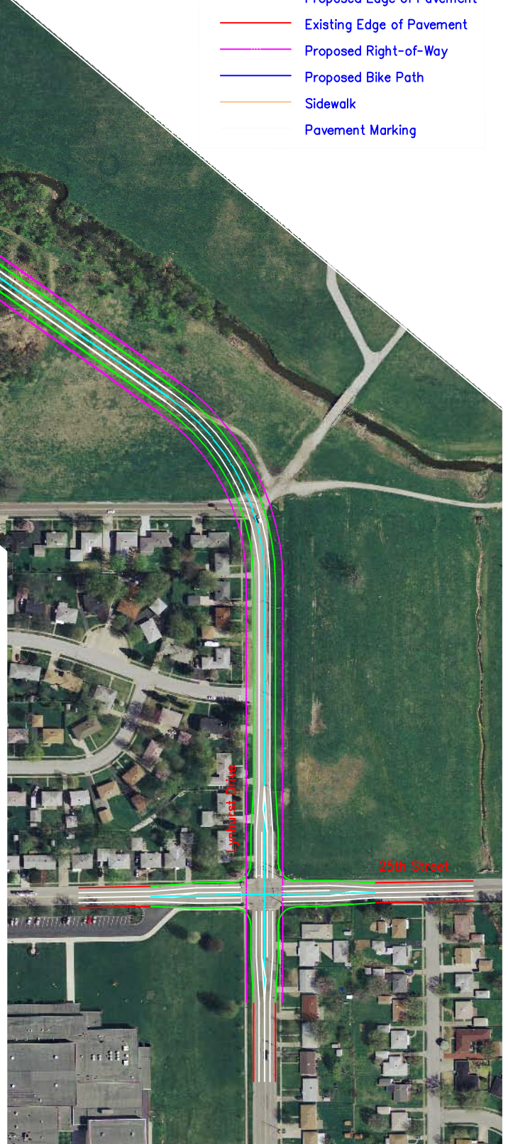
Lynhurst Drive / Moller Road Corridor