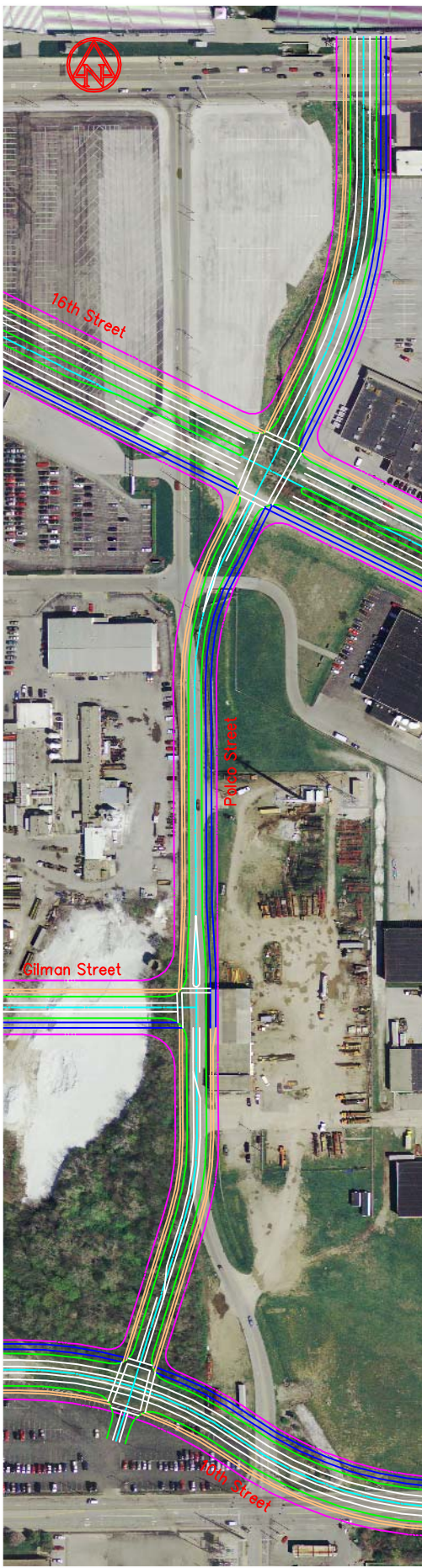
Polco Street Scale: 1" = 300'